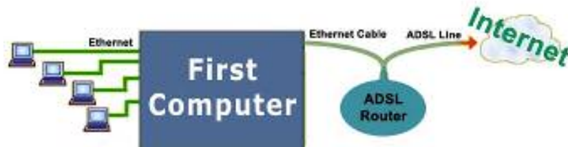
Network with an ADSL router and a server

The engineer will then install broadband on your network. This involves configuring the router to the range of IP addresses used by your network, installing the modem on the server and testing that the connection is working satisfactorily on each machine on the network.